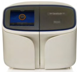
Ion GeneStudio S5 System