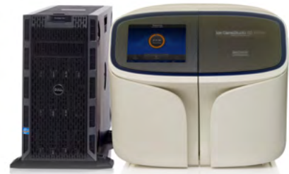
Ion GeneStudio S5 Prime System