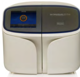
Ion GeneStudio S5 Plus System